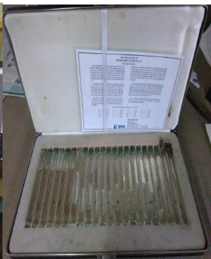
GARDENER BUBBLE VISCOMETER