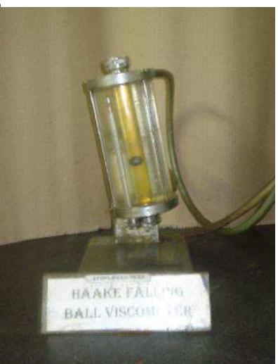
FALLING BALL VISCOMETER