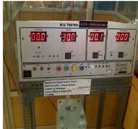
HIGH VOLTAGE TESTER