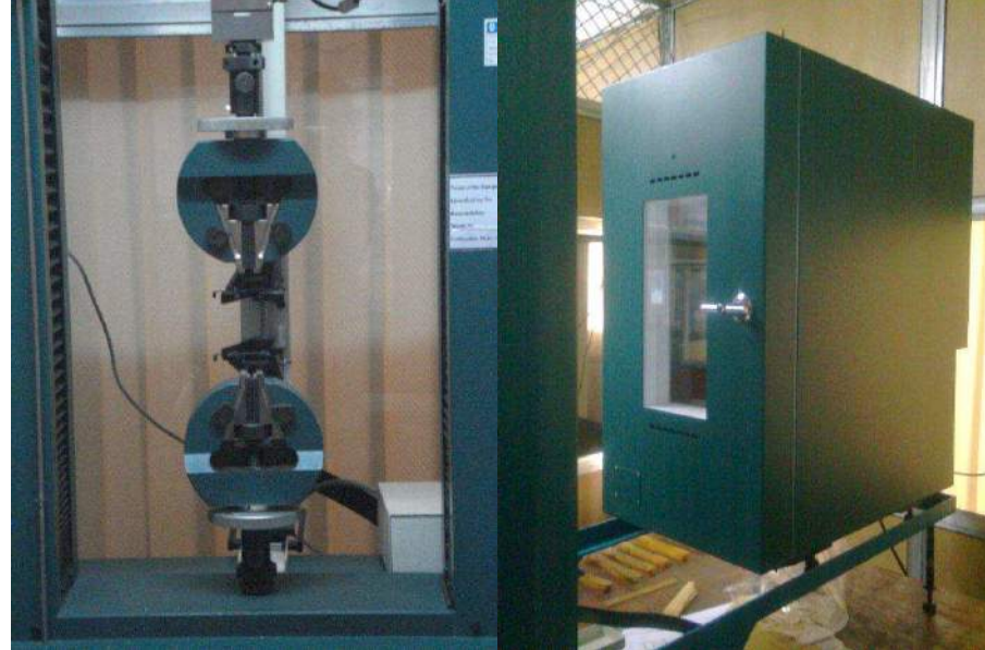
UTM - 50 KN