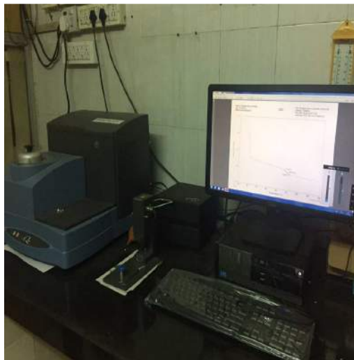
DIFFERENTIAL SCANNING CALORIMETER (TA INSTRUMENTS)