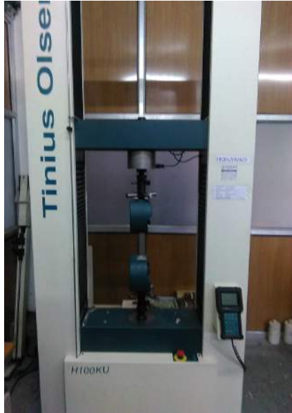
UTM - 100KN