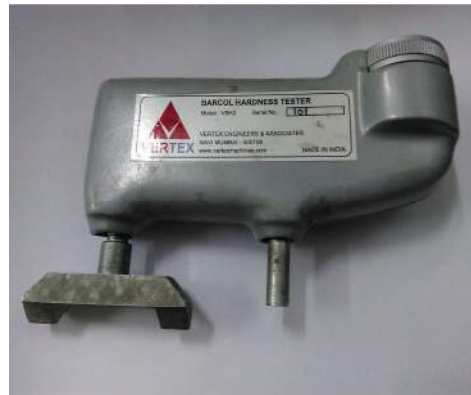
BARCOL HARDNESS TESTER