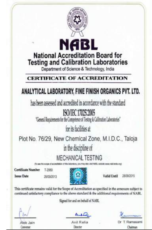
[CERTIFICATE - MECHANICAL]

FINE FINISH ANALYTICAL LABORATORY Testing. Analysis. Interpretation.