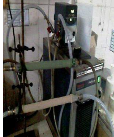
ANTICONDENSATION TEST SET UP